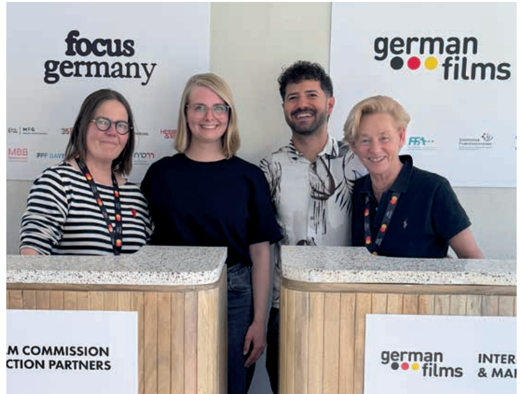
The German Pavilion team is hosting a wide-ranging series of events in Cannes

EVERY DAY, A FOCUS ON A PAVILION AT THE VILLAGE INTERNATIONAL. TODAY, THE GERMAN PAVILION