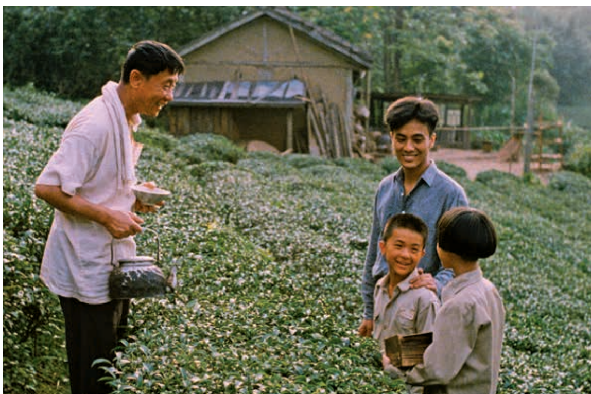
— The Dull-Ice Flower