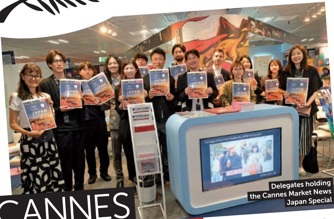
Delegates holding the Cannes Market News Japan Special