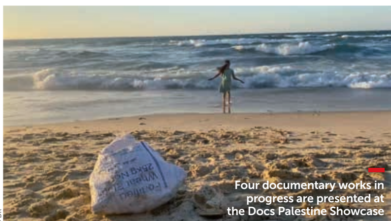
Four documentary works in progress are presented at the Docs Palestine Showcase