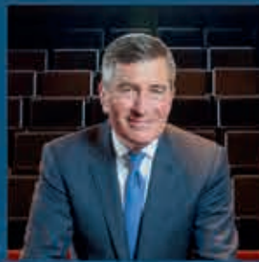
Charles Rivkin Chairman and CEO, MPA