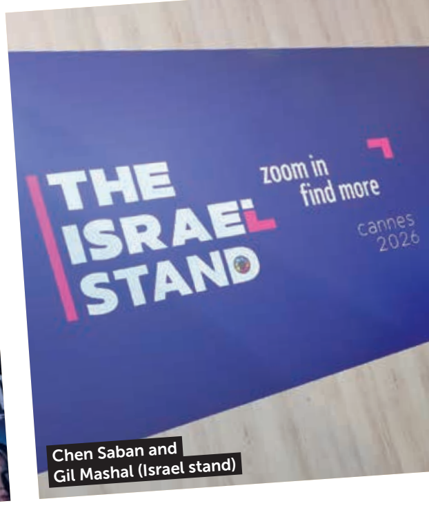
Chen Saban and Gil Mashal (Israel stand)